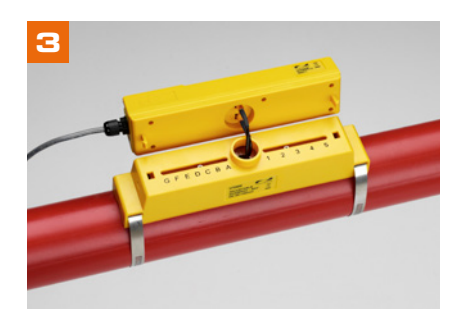
Connect power and sensors to electronic assembly