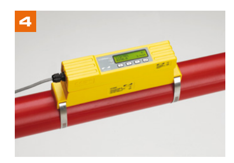
Click electronic assembly onto guide rail and sensor assembly