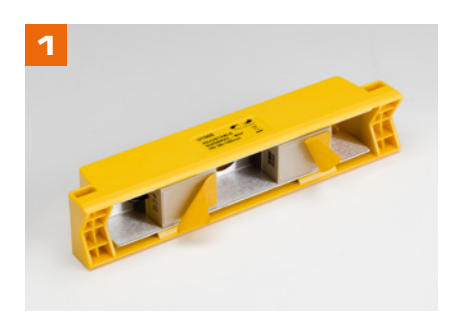
Guide rail and sensor assembly showing gel pads applied