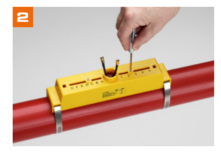
Clamp guide rail and sensor assembly to pipe and release sensor locking screws