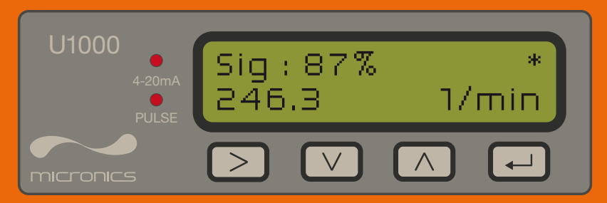
U1000MKII-FM Flow Reading Screen